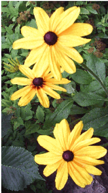
Rudbeckia hirta ( Black-eyed Susan )